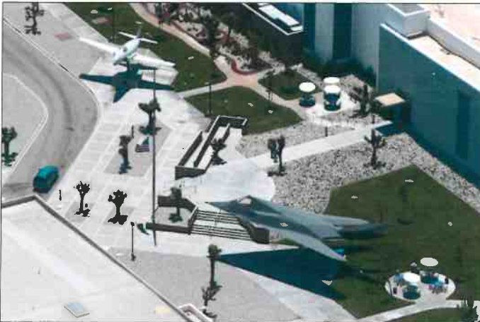
Aerial Achievements: Entrance to Lockheed Martin's Skunk Works facility in Palmdale.

skilled or are willing to learn skills," he added.