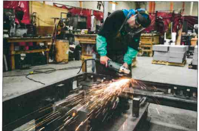
Security: Technician burnishes barricade at Delta Scientific in Palmdale, No. 38 on list.

"There is high demand for people who are