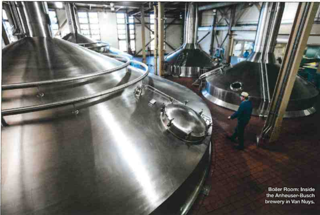
Boiler Room: Inside the Anheuser-Busch brewery in Van Nuys.

Other manufacturing uses represented in the region include electric vehicles produced by BYD Ltd. Corp. in Lancaster, No. 7 on the list; solar panels made by Spectrolab in Sylmar at No. 21 on the list; recreational vehicles from Lance Camper , also in Lancaster, at No. 13; and vehicle barricade systems manufactured by Delta Scientific Corp. , in Palmdale, which ranks No. 38.