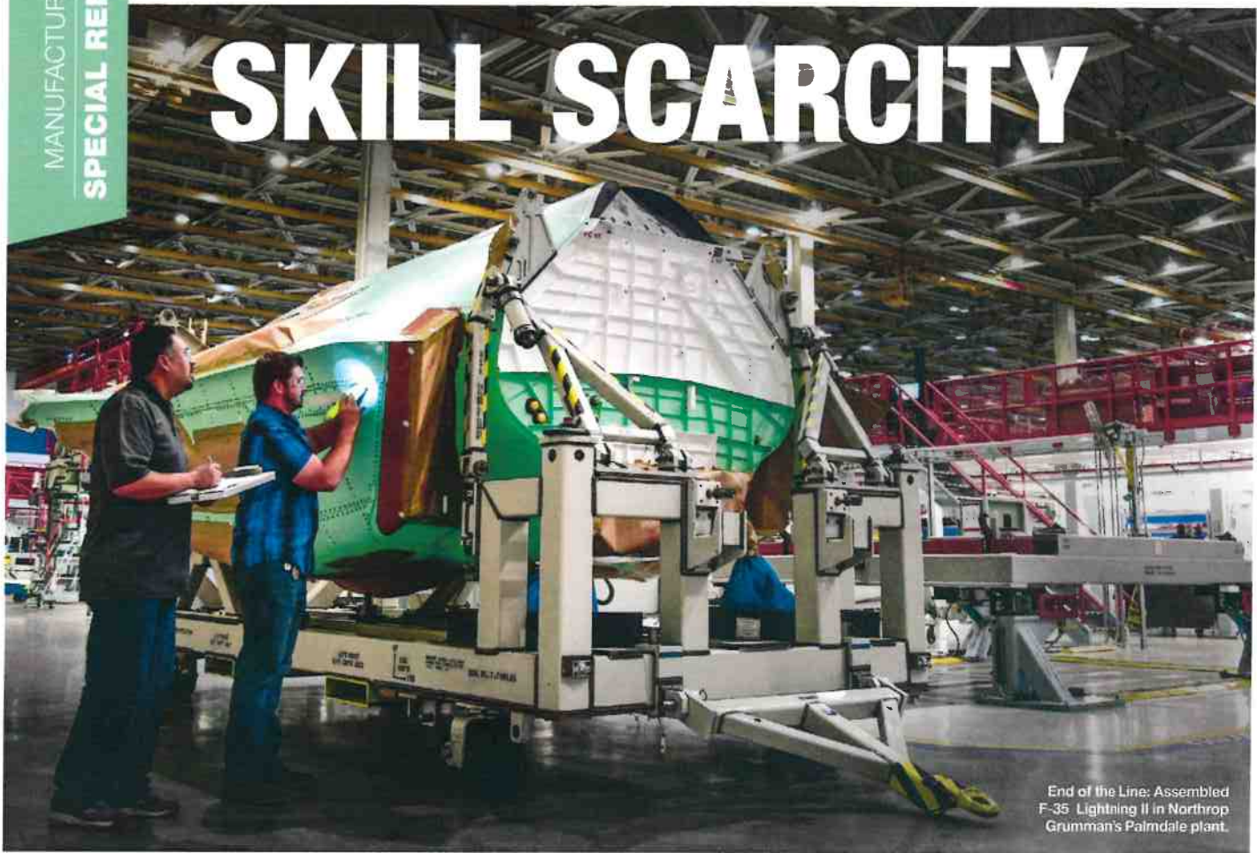
End of the Line: Assembled F-35 Lightning II in Northrop Grumman's Palmdale plant.